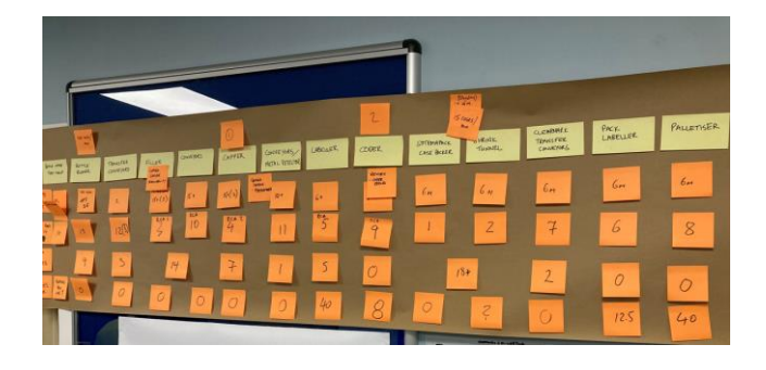
Fig 1: Manufacturing Map

Contact Pro-Reliability Solutions to see how they can support your Reliability Journey.