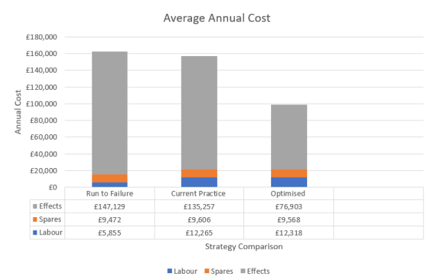
Fig 3: FMECA Strategy Comparison